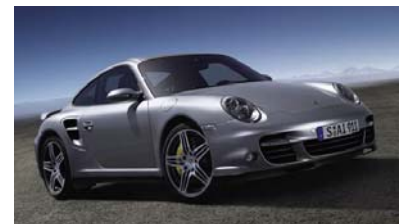
The new Porsche 997 Turbo