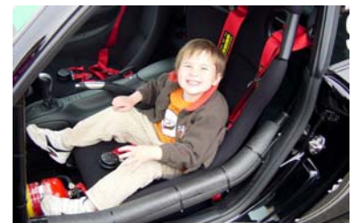
The smile says it all !!

The remainder of the funds raised have been allocated to "Family Aid". Camp Quality regularly receives requests from Princess Margaret Hospital to address special needs for a child in care and these are allocated on a one to one basis as needs dictate.